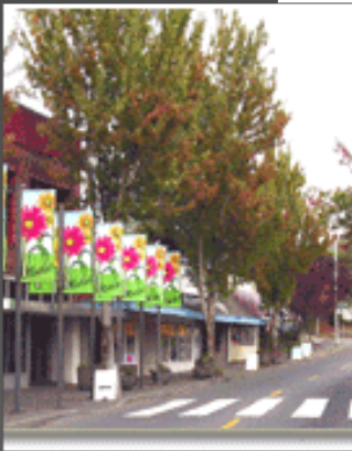
Photo of Downtown Bothell

Bothell is located about 12 miles north of Seattle and just west of Woodinville. It is well known for its rural charm.